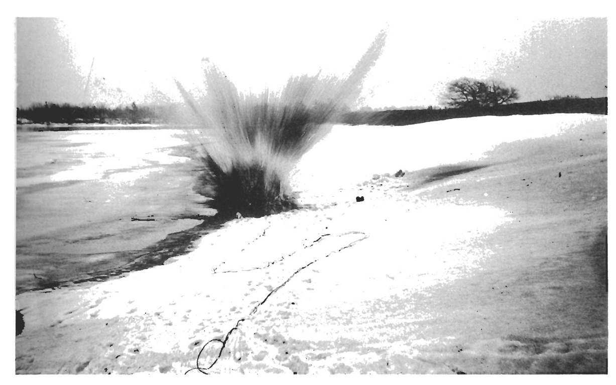
Figure 5. Ice research: expedition to Newfoundland 1924, and on the St. Lawrence River, March 1925.