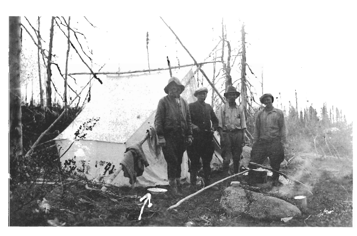
Figure 4. Prospecting photographs from R. B. D'Aigle's scrapbook.