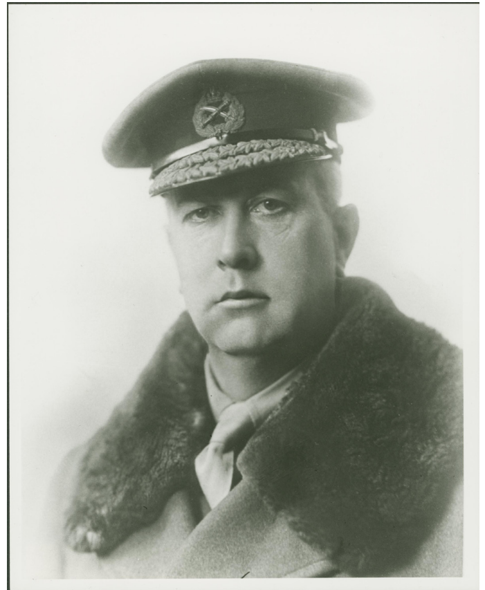
Figure 1. Portrait of Sir Arthur Currie. Black and white photographic print, 1917.

Currie, who had witnessed first-hand the horrors of combat, detested war. He believed that “War is not a means to establish peace. It is a delusion and a lie.” 7 He hoped war would not happen again, and he tried to find ways to maintain peace. He strongly believed that after World War I European domination of the world would be diminished and the status of other regions, especially Asia, would increase. He felt, however, that people in the West lacked knowledge and understanding of people in the Far East, and China in particular. He believed that universities should provide courses in area studies, such as Chinese studies. In his letter of 1932 to the Secretary-General of the League of Nations in Geneva, Currie said: “Believing, as we all do, that intellectual co-operation and mutual understanding contribute largely to international peace, we felt that such a development might in the end have a value apart from its cultural importance.” 8 He thought that the time was ripe for such a development in Canada. He found that occidental nations were realizing more and more fully the historical and cultural connection