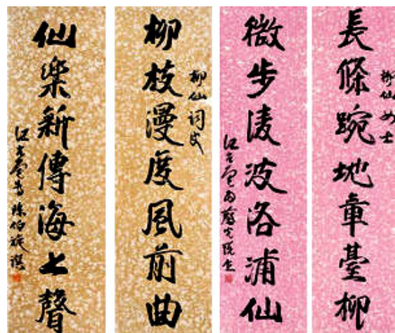
Figure 6. Kiang's calligraphy.

In 1931, with the co-operation of the Department of Extra-Mural Relations, Kiang organized the Hung Tao Society of Montreal as a branch of the parent society in China, for