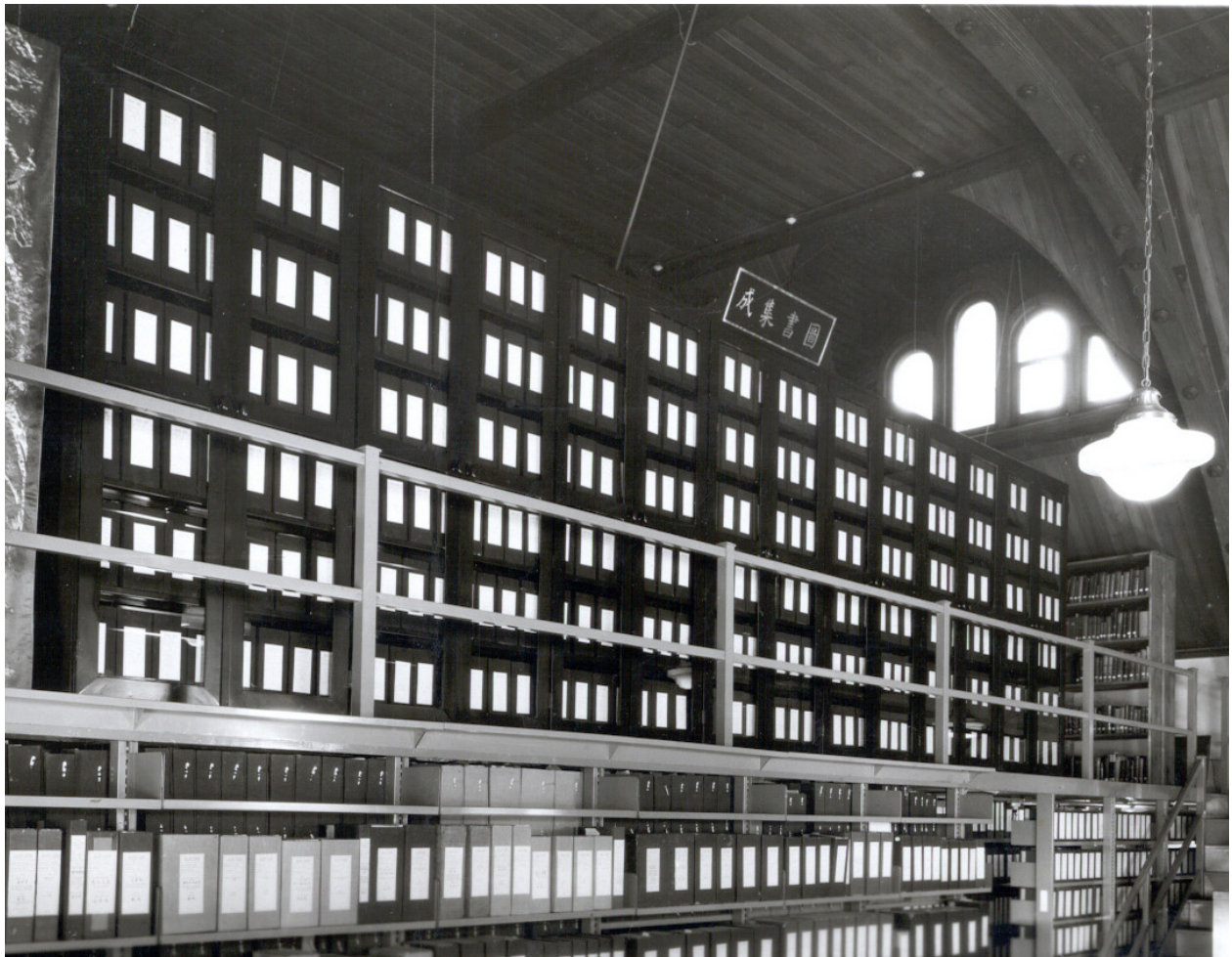
Figure 4. Gest Chinese Research Library, Redpath Library, McGill University, 1931.