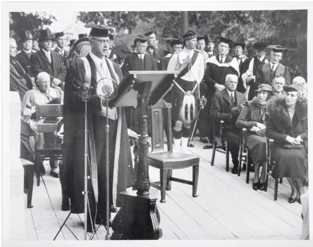
Figure 2. Sir Arthur Currie addressing a crowd at convocation, 1930. Black and white photographic negative, 1930.

I hope that a certain amount of assistance will also be received from the Trustees of the Boxer Indemnity Fund. This fund, in accordance with the still unpublished report of the Advisory Committee, will be administered by a board of trustees of which the majority will be Chinese, and part of it will be devoted to some thirty scholarships of £300 each and a number of fellowships of £500. As the report originally read it provided that the students holding the fellowships should receive their training in the universities of England, but as a result of communications between ourselves and the Governor General an effort is being made to have the report include Dominion universities. 12