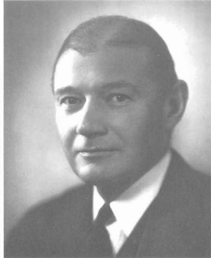
Figure 6. Lewis William Douglas, Principal 1937-1939.