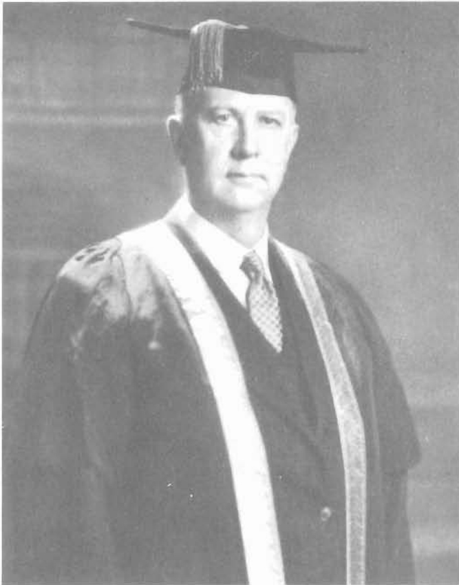
Figure 3. Sir Arthur Currie, Principal 1920-1933.