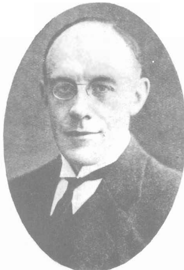
Figure 2. Sir Auckland Campbell Geddes, Principal 1919-1920.